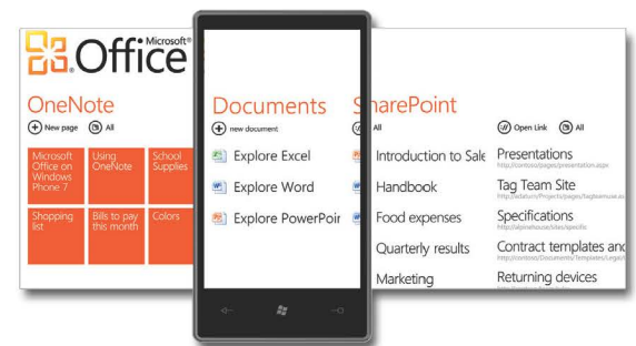
The Office Hub for Windows Phone for anywhere access to documents

That is why we recommend Microsoft® Office 365 for your business. Office 365 is a set of cloud-based services that bring together Office 2010 with sites to share documents, IM, web conferencing, and the power of Exchange Online, the industry’s leading business-class email with 25GB mailboxes and built-in layers of antivirus and anti-spam protection.